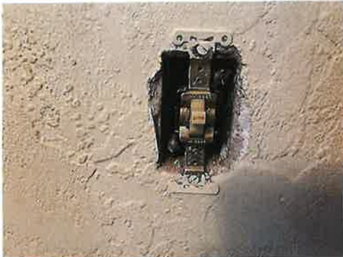
948-1 Plaster Typical Interior Walls/Ceilings