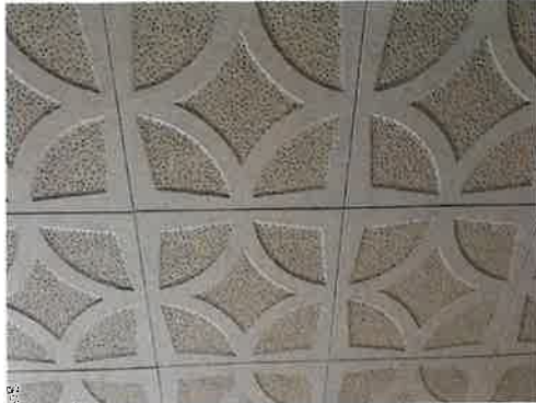
948-2 12"x12" Ceiling Tile Interior Family Room