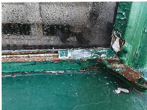
948-5 Glazing Typical Exterior Windows