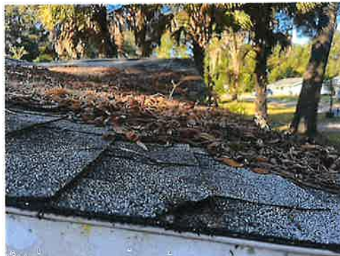
948-4 Asphalt Shingle/Tar Typical Exterior Roof